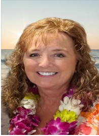
American Legion Auxiliary 2025-2026 Department President