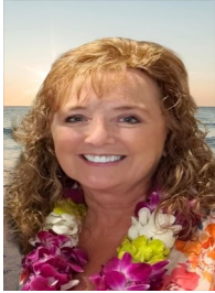
American Legion Auxiliary 2025-2026 Department President