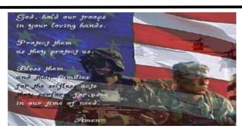
Serve & Honor Those Who Defend our Freedom While Building Future Leaders