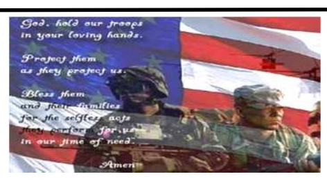
Serve & Honor Those Who Defend our Freedom While Building Future Leaders