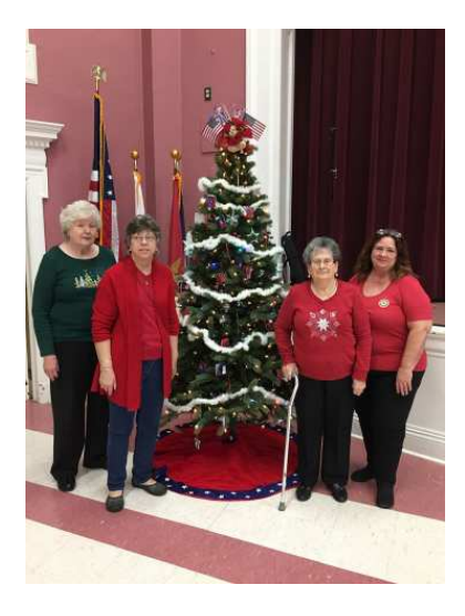
2017 Huntington VA Gift Shop