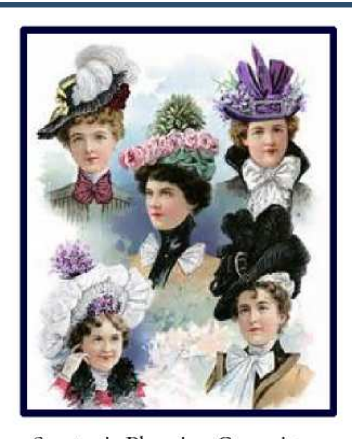
Strategic Planning Committee